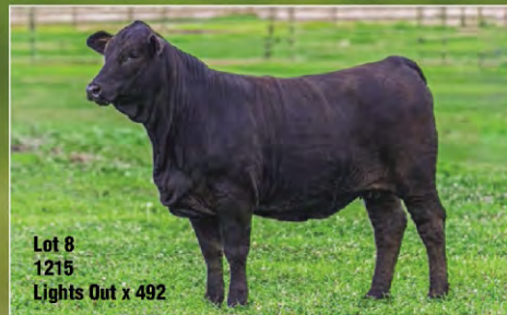
Lot 8 1215 Lights Out x 492