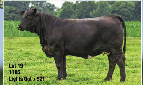
Lot 19 1105 Lights Out x 521