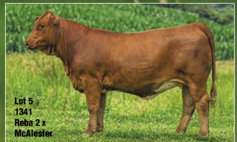
Lot 5 1341 Reba 2 x McAlester