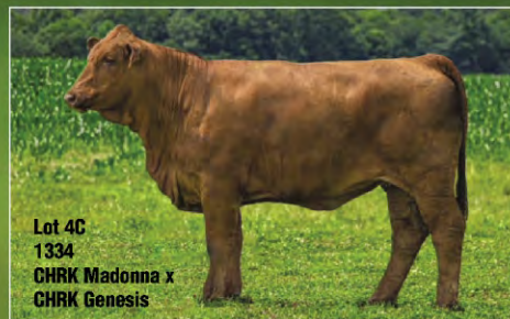
Lot 4C 1334 CHRK Madonna x CHRK Genesis