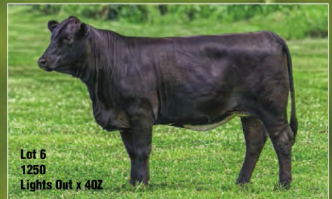
Lot 6 1250 Lights Out x 40Z